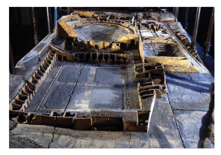
Surviving section of the Pompeii Model before restoration