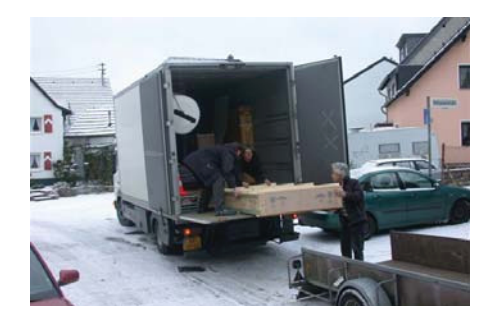
The new section being crated at the start of its journey to London

While moulding the masses of ash from cork, we took special care to make the drama of the eruption and its consequences visible. Thus the relics of buildings and streets disappear to some extent into those 'gentle' hills of ash.