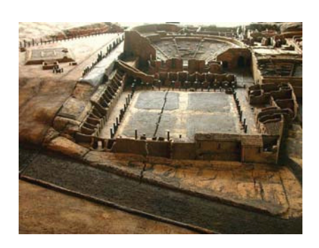
Detail of Pompeii model showing the new and old sections side by side

The excavations themselves we made from plaster and cork, just as in the antique model, and then adjusted the colour to match the original early nineteenth-century section. However, it is only on the model stand itself and then in the restored Model Room that the work will be emotionally comprehensible and hopefully become a new attraction for Sir John Soane's Museum.'