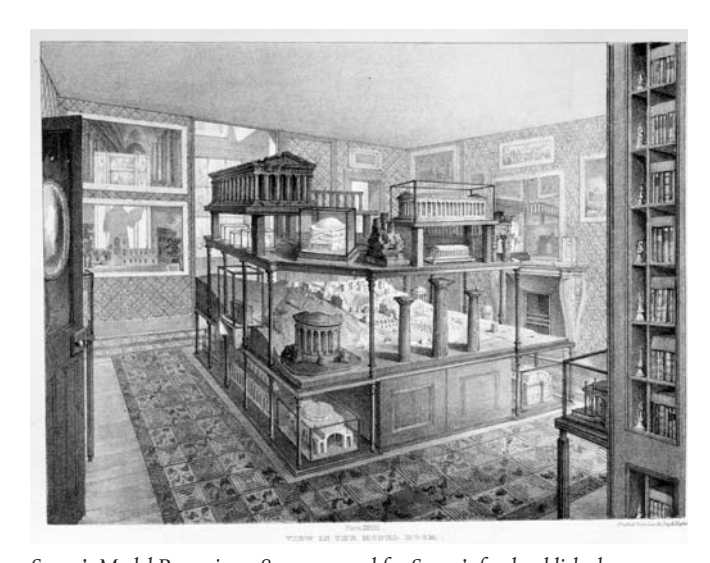
Soane's Model Room in c.1834, engraved for Soane's final published Description of his house

This great model, showing Pompeii as it was in 1820, was cut almost in half in the 1890s when the model stand was reduced in size to make it easier to accommodate within the Museum when the original model room was disbanded.