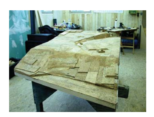
The new section of the cork model, depicting the so-called 'Forum Triangolare' during construction in Dieter's workshop in Bonn