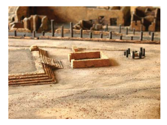
Four details showing the new 'Forum Triangolare' section of the Pompeii model