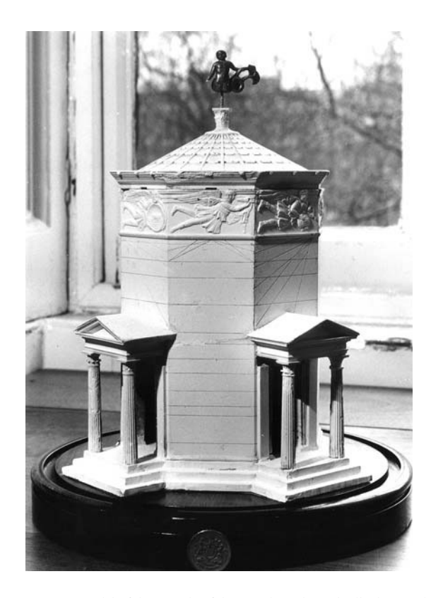
Fouquet model of the Temple of the Winds, Athens, badly damaged in World War II, after repair by Colin Cunningham in the mid-1990s