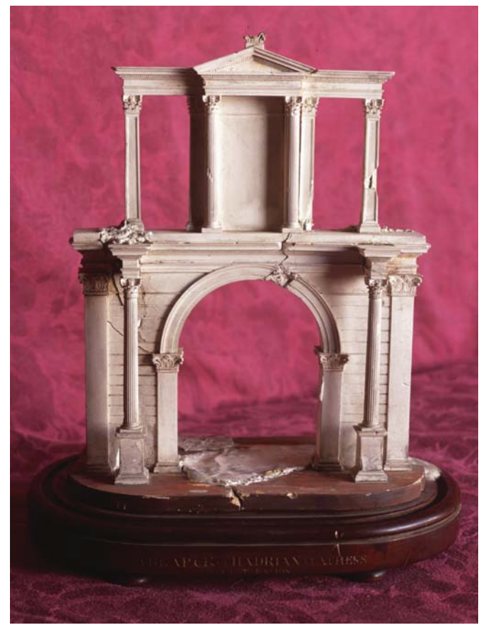
Above: Fouquet model of the Arch of Theseus or Hadrian, Athens, as it looks today following War damage